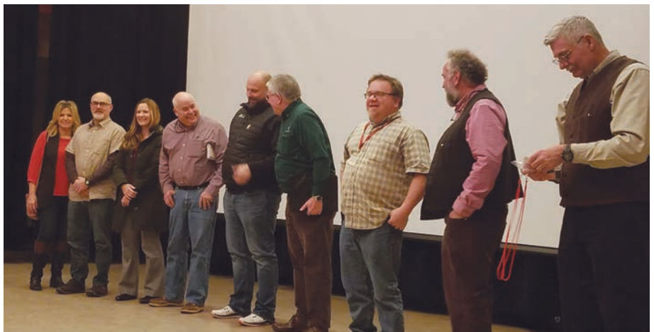
2019 MOWC Planning Committee