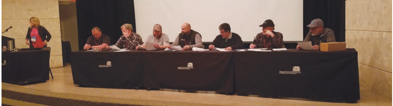
MSTA Board at Annual Meeting