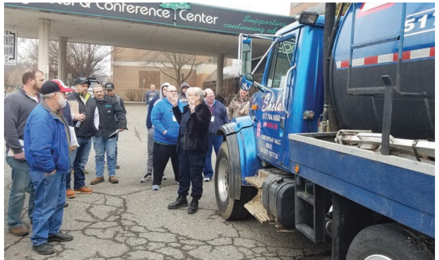
Michigan Truck Safety