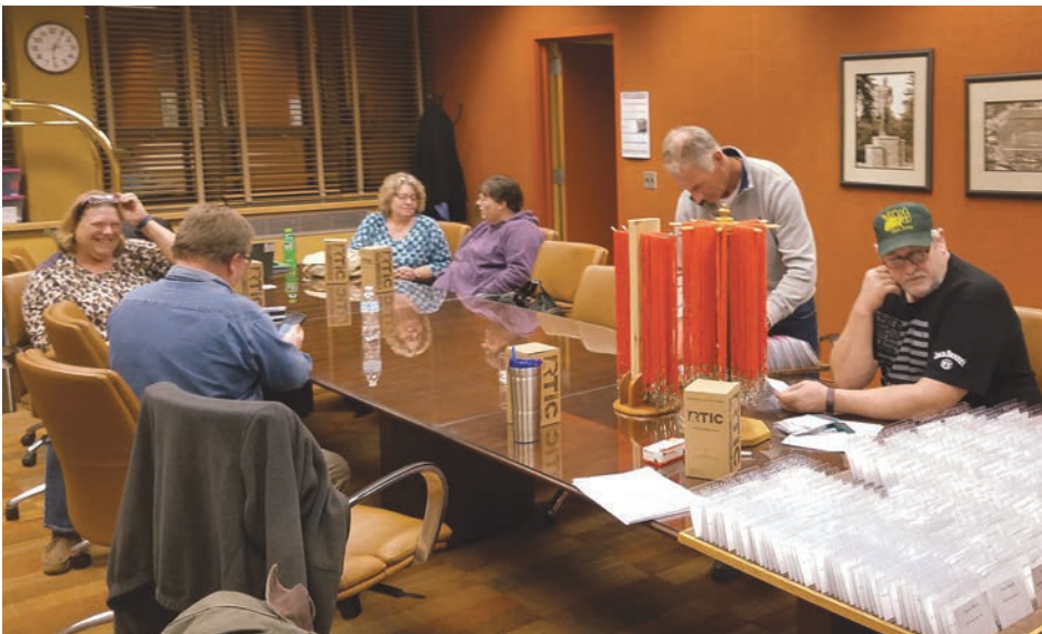
Monday Evening Badge Stuffing Meeting