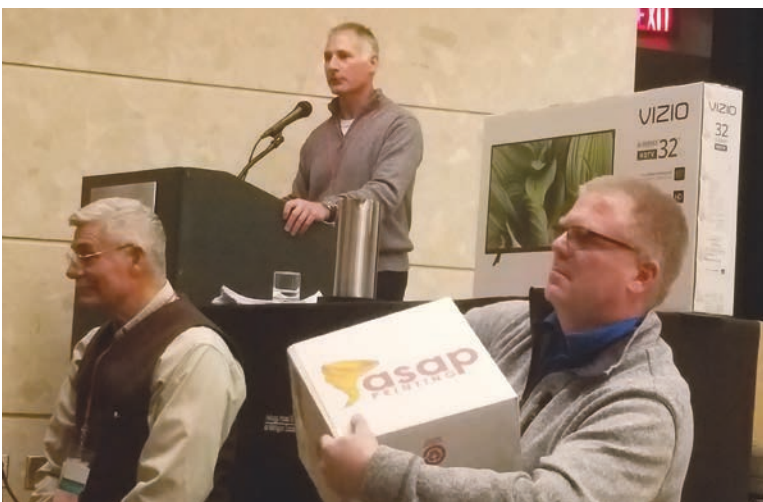
Thursday Prize Drawing in Auditorium