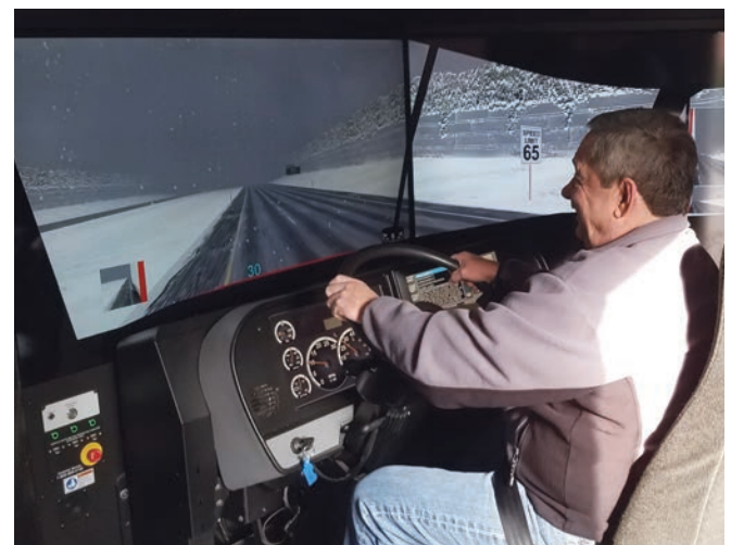
Semi Truck Simulator